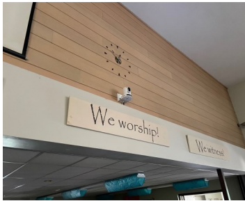
This new camera in the back of the sanctuary films our services.