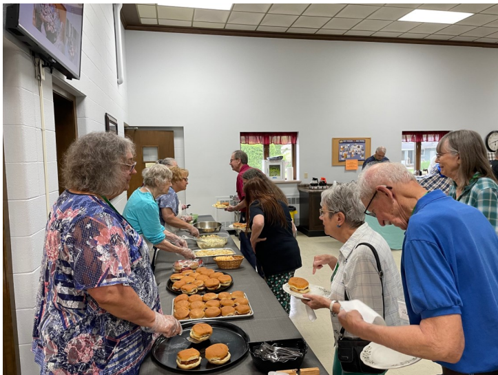
Food for Thought, "2.0!" Our neighbors at St. James are continuing the Dinner Church during the summer. Many Emmanuel folks have been joining us for terrific fellowship!