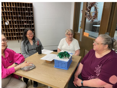
A few friends at St. James ready to welcome before the meal starts.

God has been working in amazing ways this past year creating relationships through our