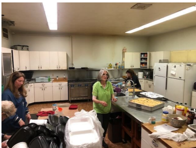
A busy kitchen! Many hands at work at Emmanuel on May 15th.

God has been working in amazing ways this past year creating relationships through our Wednesday Night